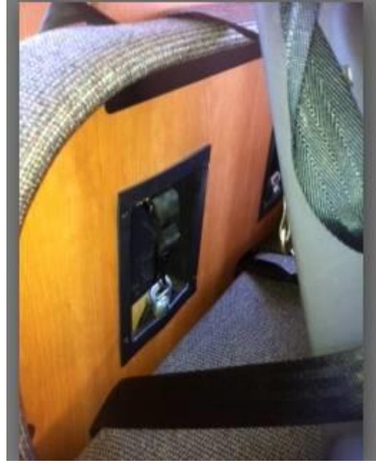
4) Top tether attached to lower anchor